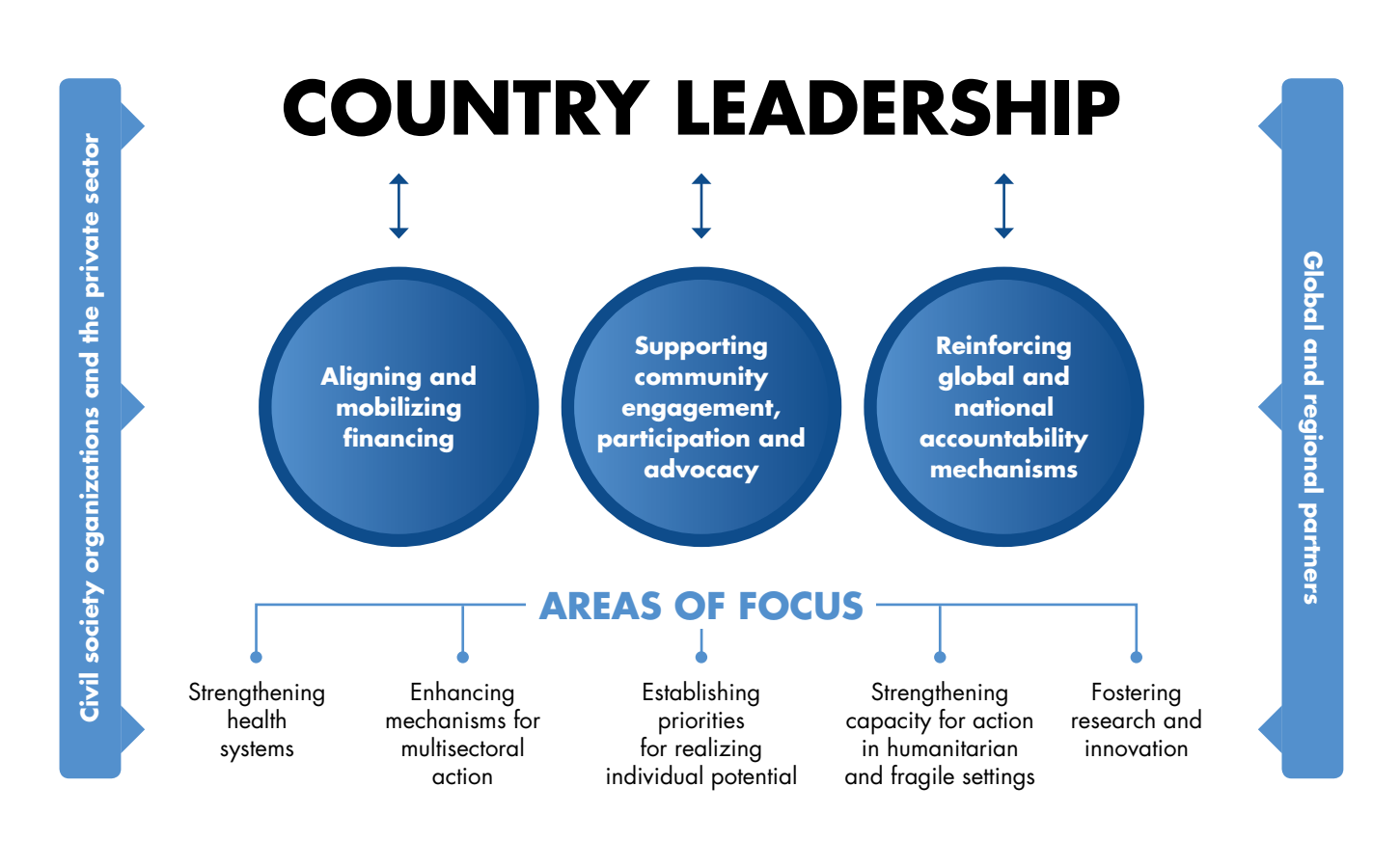
Figure 1. Operational Framework ingredients for action

While governments have the leadership and stewardship role for planning and implementation for all of the ingredients for action, true country ownership occurs when governments work with other stakeholders within and beyond government, including civil society organizations, networks for young people, associations of health care professionals, research and training institutes, as well as the private sector. Figure 1 presents a visual relationship of the nine ingredients for action.